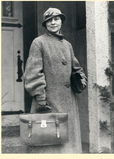
Elizebeth Friedman Source:National Security Agency

http://nsa.gov/about/cryptologic-hertiage/museum/